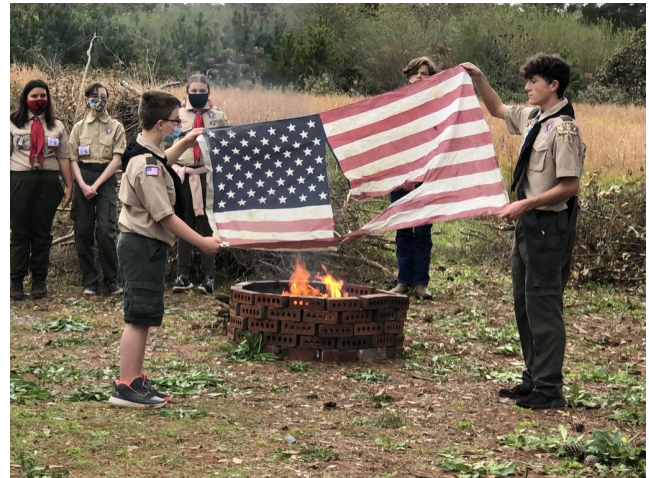
Troop 4199, and Troop 5199

ScoutingWire— Everything a Scout Should Know About U.S. Flag Retirement